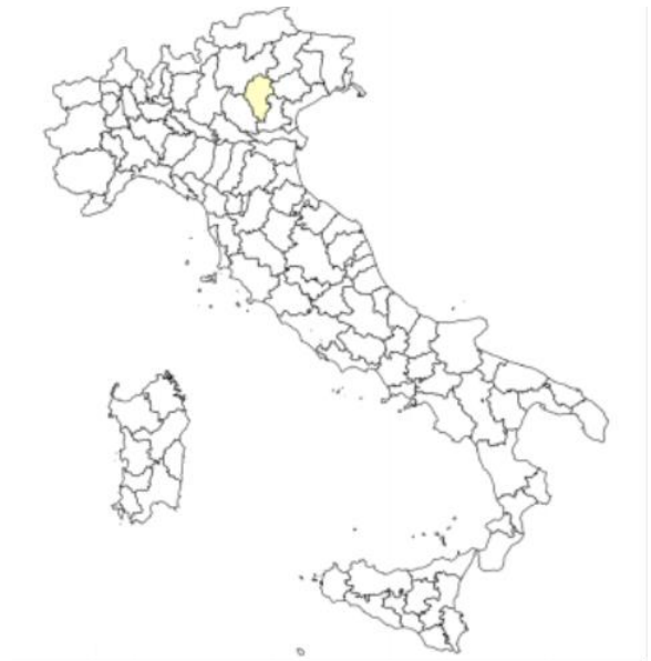
Figure 1. Provinces where WNV has been detected in vectors, animals and humans (blood donor, fever and neuroinvasive cases)