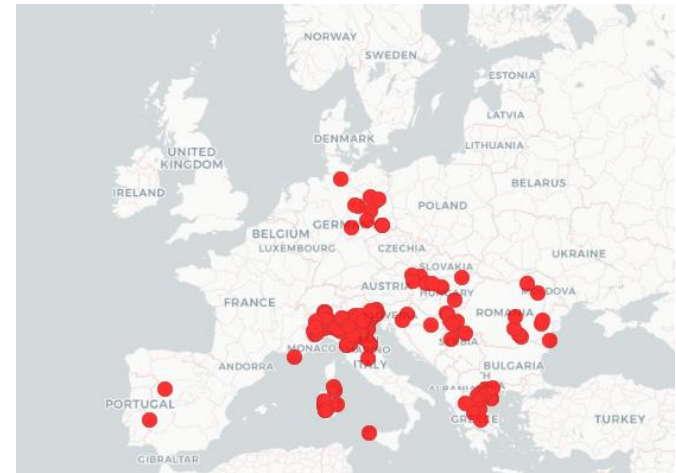
Table 1. Number of cases (confirmed and probable) of West Nile Disease in Europe and in the Mediterranean Basin