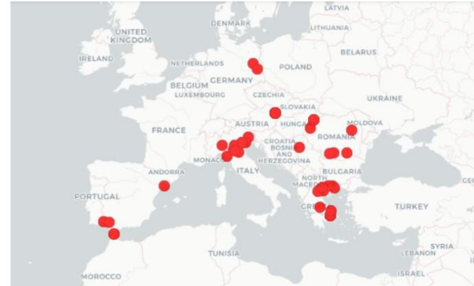
Figure 1. Geographic distribution of cases (confirmed and probable) of West Nile Disease in Europe and in the Mediterranean Basin