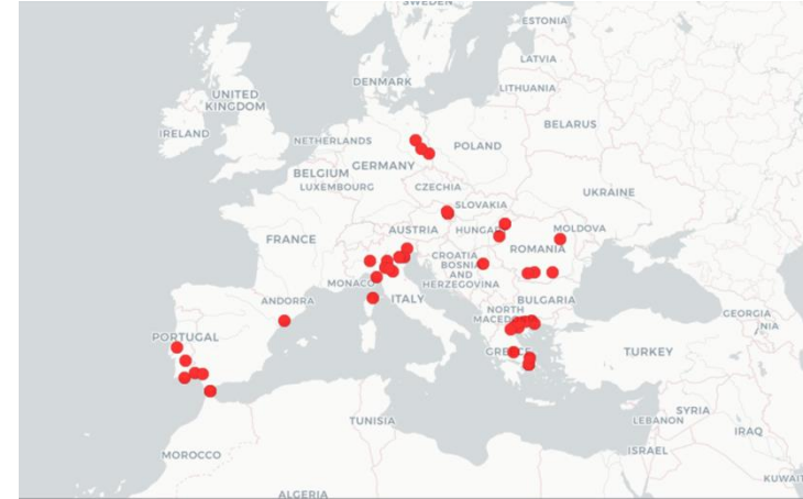
Figure 1. Geographic distribution of cases (confirmed and probable) of West Nile Disease in Europe and in the Mediterranean Basin