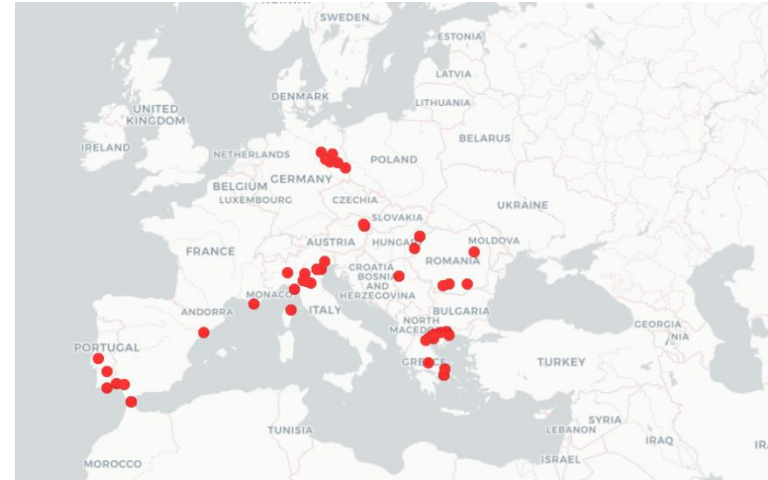
Figure 1. Geographic distribution of cases (confirmed and probable) of West Nile Disease in Europe and in the Mediterranean Basin